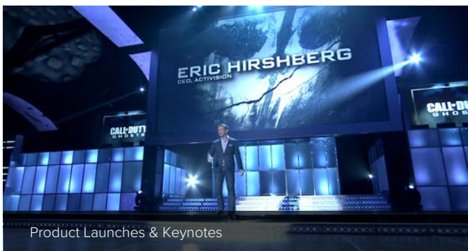
Product Launches & Keynotes