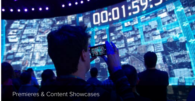
Premieres & Content Showcases

Transforming traditional experiential activations to address today's ever-changing social norms.